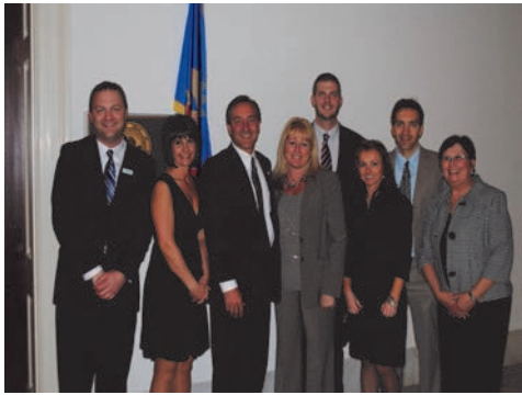
NDANA Representatives with Congressman Berg